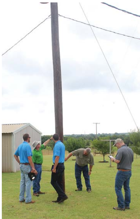
REC employees have begun working on site locations for the new radio frequency advanced metering infrastructure.

The Lindsay Municipal Hospital, South Central Medical and Resource Center, along with the Lindsay Emergency Medical Service, will be providing a health fair free to members. They will be performing this service from 8 a.m. until the beginning of the business session at 10 a.m. Members planning to have the blood test done should refrain from eating after midnight prior to the health fair. For the convenience of our members, there are two consent forms for the health fair on the official notice.