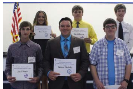
REC's 2018 Youth Tour finalists.