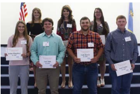
REC's 2018 scholarship winners.

REC has offered these programs to area students since 1989. Over the past 29 years REC has provided: 304 scholarships; sent 86 high school juniors to the Youth Tour in Washington, D.C.; sent 78 high school juniors to the Cooperative Youth Leadership Camp; and sent 196 eighth grade students to the YouthPower Energy Camp.