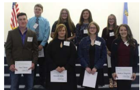
REC's 2018 Energy Camp winners.